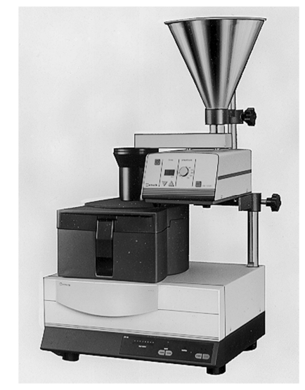
Ultra centrifugal mill